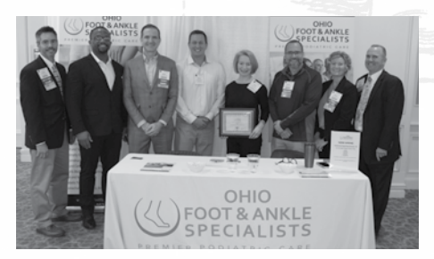
Gold Seminar Sponsor: Ohio Foot and Ankle Specialists